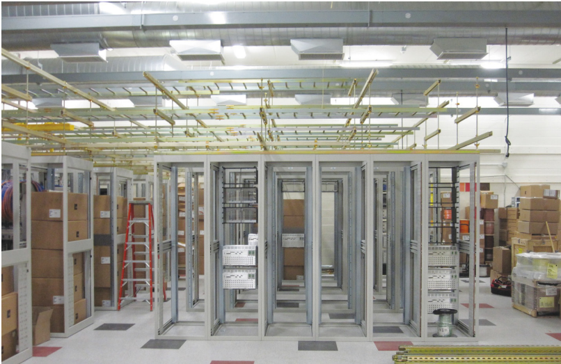
Progress photo of equipment receiving, staging and installation during a large critical facility EF&I project for a major customer.

REAL-WORLD EXPERIENCE = REAL-WORLD RESULTS